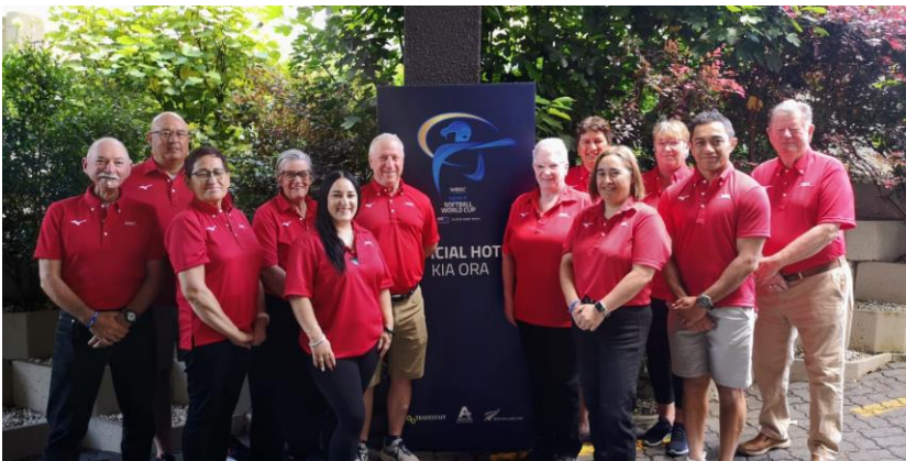
Full NZ Crew